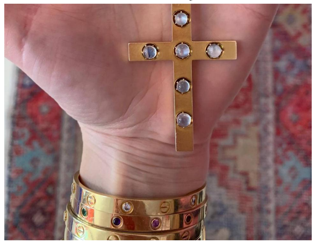
Meaghan Flynn Petropoulos' Moonstone (Birthstone) Cross FOR FUTURE REFERENCE