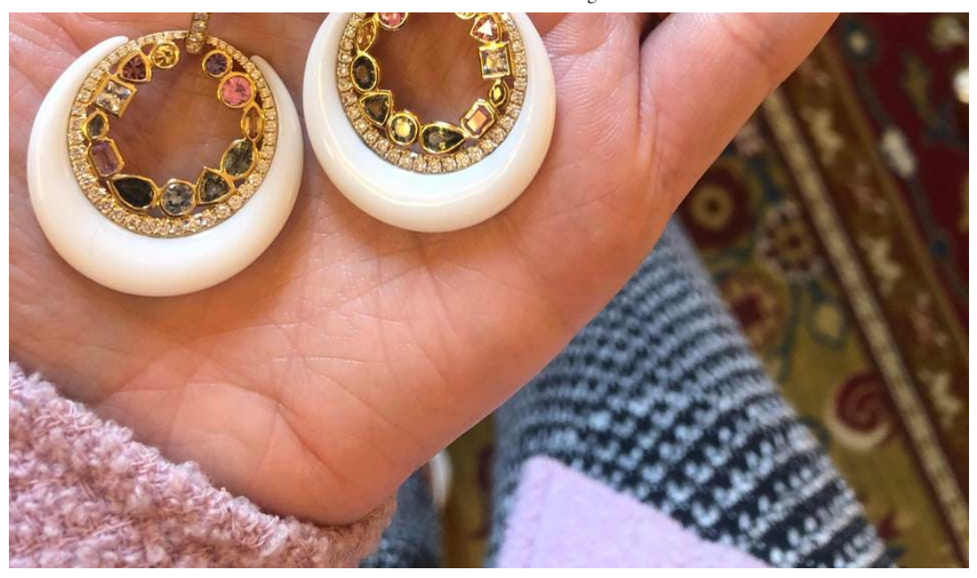
Sorellina Pearl and Moonstone (Birthstone) earrings SORELLINA